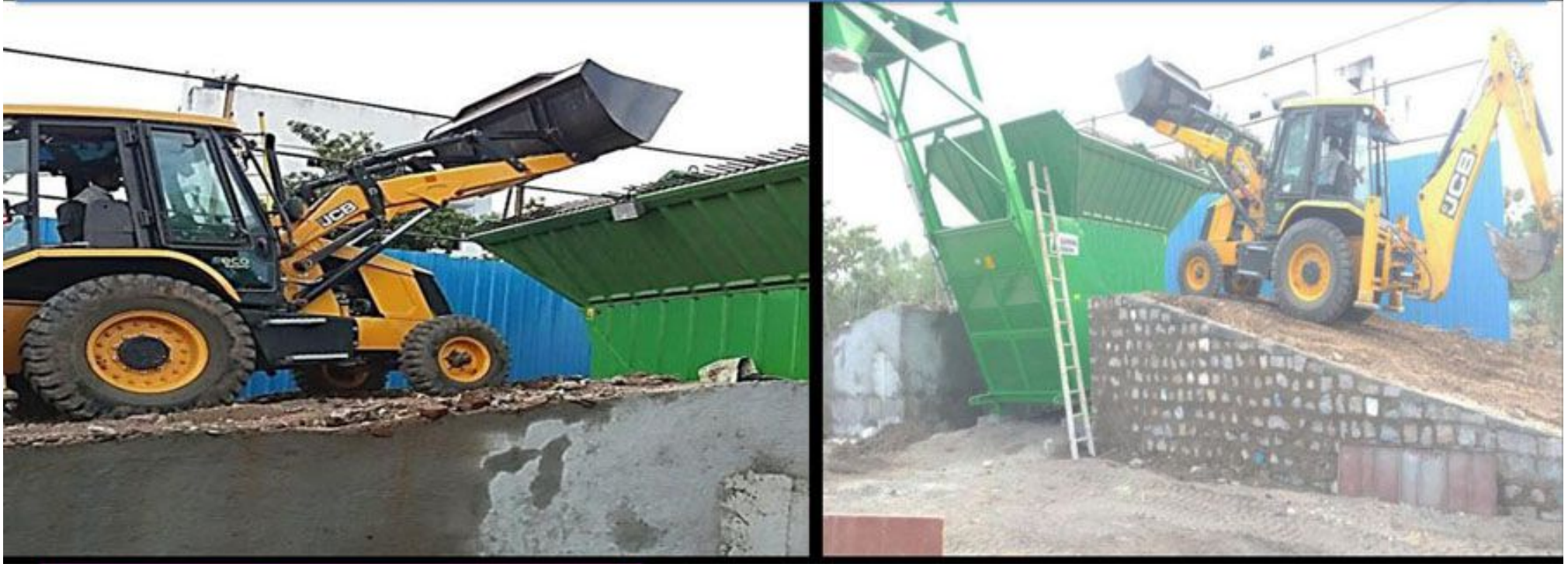
Batching Plat – 30 Cum Capacity