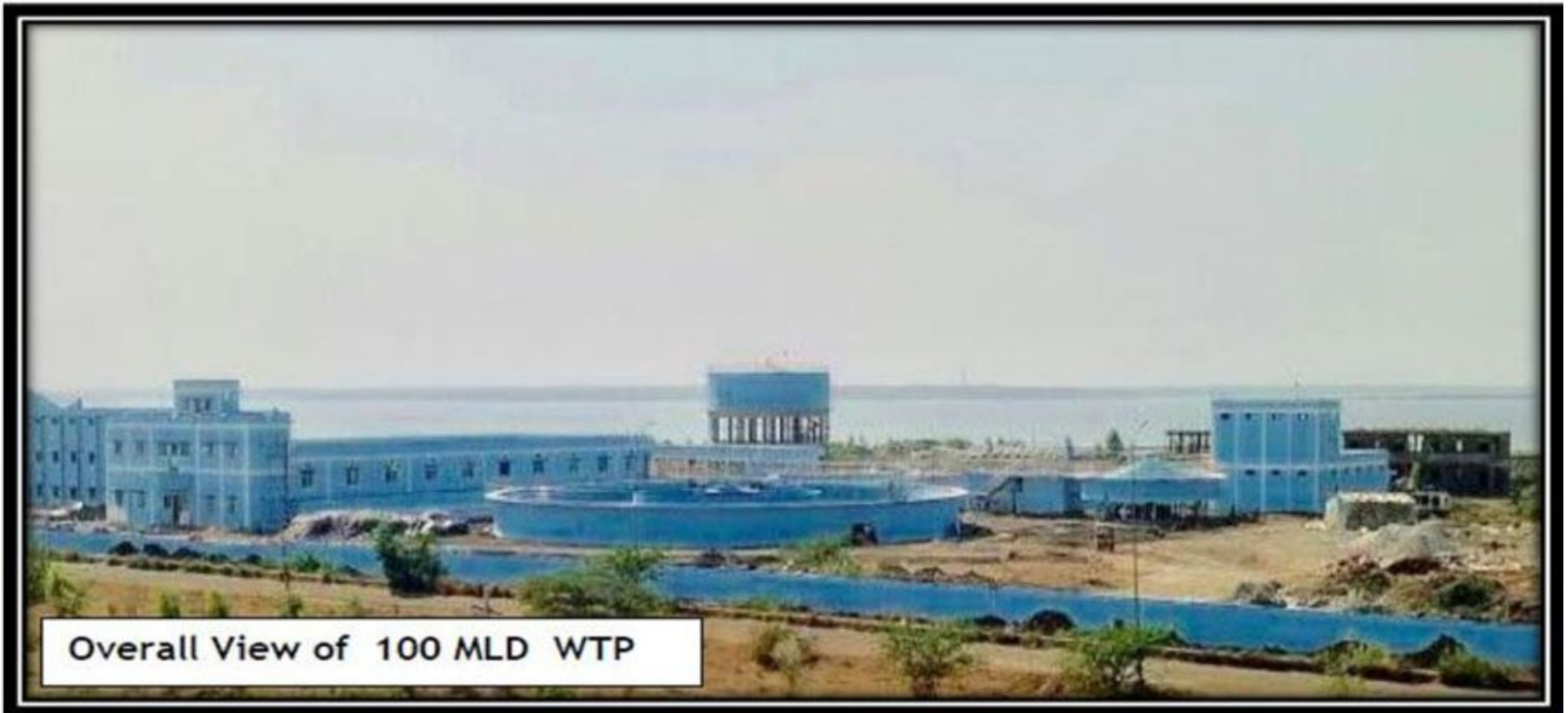
Overall View of 100 MLD WTP